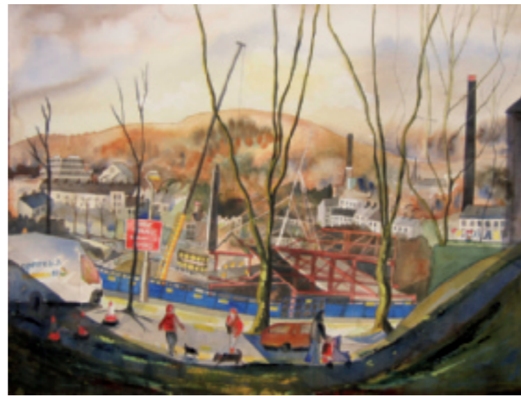
Woman with Red Cloth, Bingley