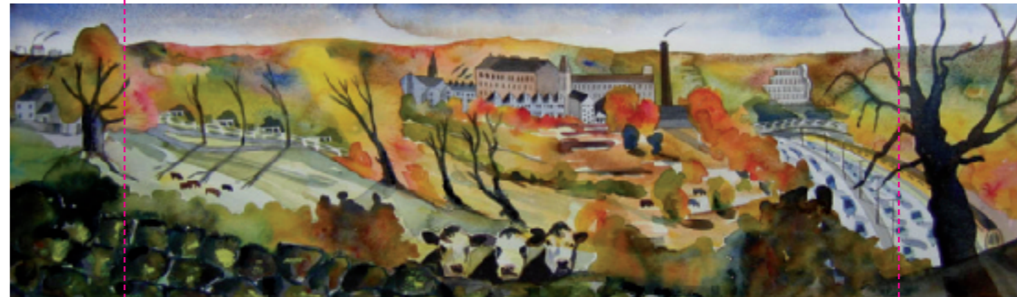
3 Nosey Cows, Bingley