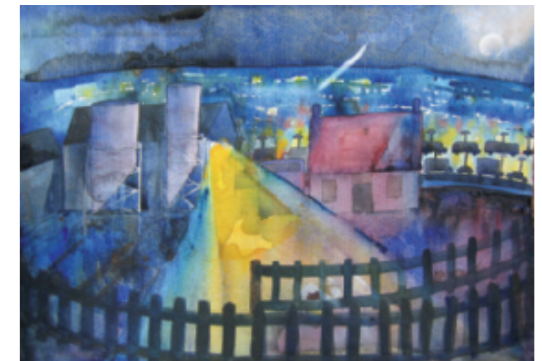
The Strangest Place, Bingley