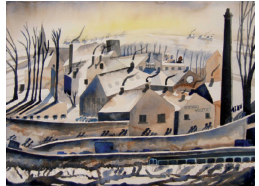
Twenty to Three, Bingley